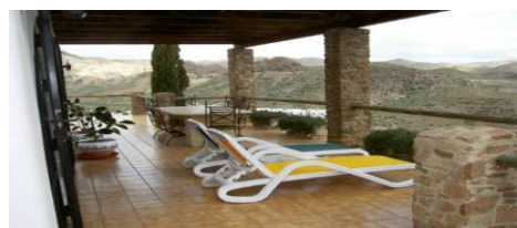
Hotels / Apartments